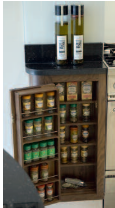
above From dried parsley to powdered paprika, many seasonings are organised in the spice unit.